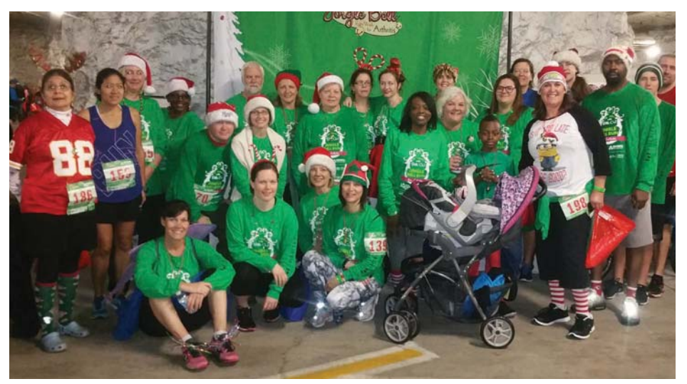
Our Quest and ExamOne co-workers from Lenexa, Kansas