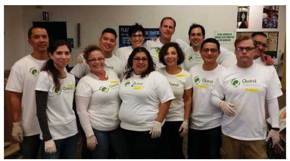
Our Los Angeles co-workers.

Inside each Quest employee is the heart of a volunteer who gives time and resources to find a cure for disease, fight hunger, raise awareness, and help others. Whether volunteering as a department for team building or at a location through QuestCares, our employees are committed to creating a healthier world. Here are just a few examples of our efforts in 2015.