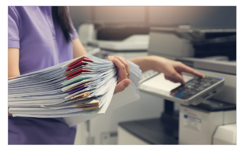
Quanum ECS enables organizations to manage paper and digital content throughout the healthcare enterprise with IDC.

To meet CentraCare's workflow needs, the Quest team configured the batch class to be able to recognize the document type by the header on the EMR's printed sheets, rather than the barcode. Sample documents were provided to train the system so documents could be indexed based on the document type. Batches with 70 pages or more were initially tested. If the system identifies a potential indexing error, it is presented to the user to correct as needed. Once all documents within the batch are indexed and validated, the entire batch exports to the appropriate patient record in Quanum Enterprise Content Solutions.